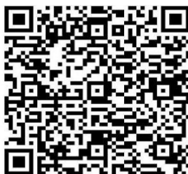
Figure 2. An image of QR code

This study focuses on the quick response code (QR code) [11–14] which is categorized under matrix symbology barcode. QR code was first introduced by a Japanese company, Denso Wave Incorporated, in 1994. It was then approved in 2000 as an AIM standard, JIS standard, and ISO standard [7], [14], [15]. Figure 2 shows an example of a QR code.